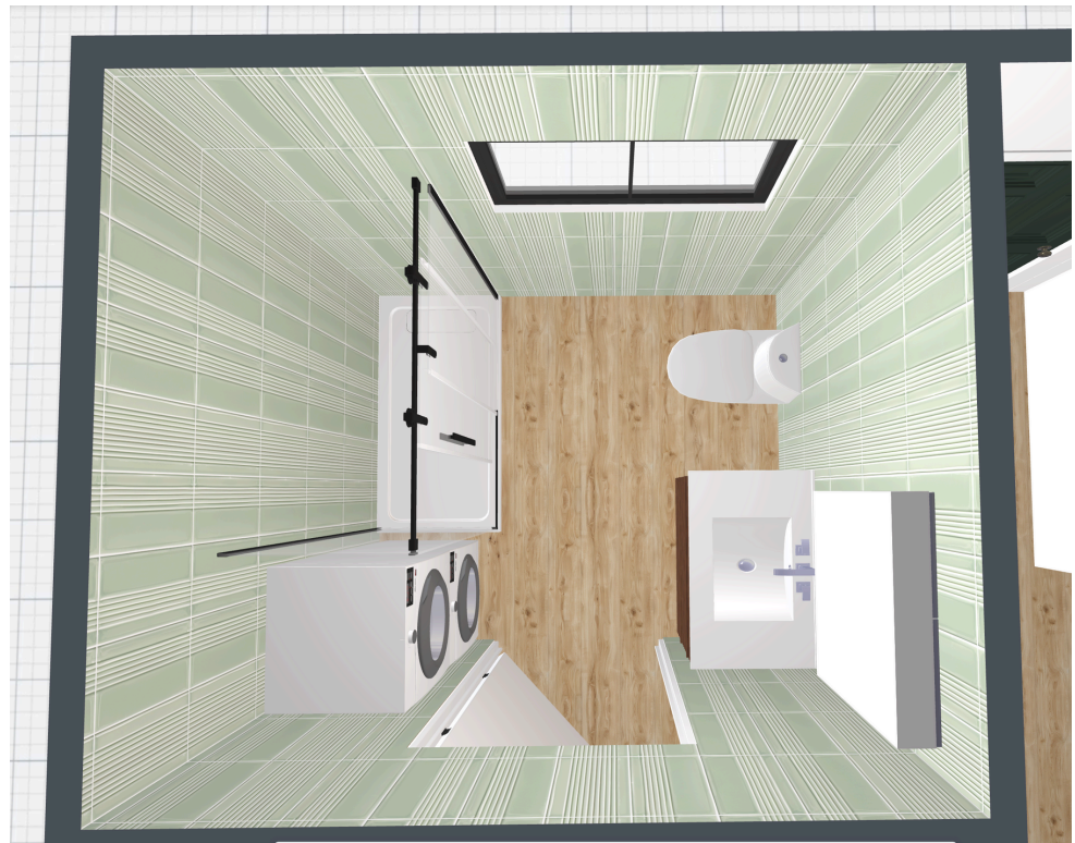
AERIAL VIEW OF BATHROOM