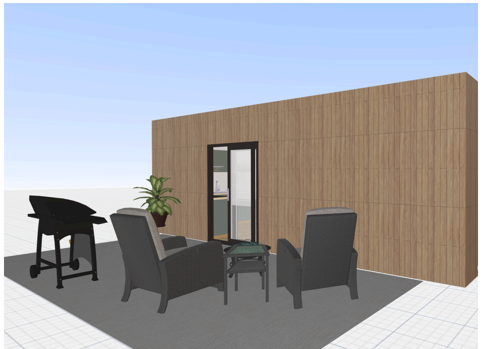
VIEW OF BACK PATIO. (PATIO IS APPROXIMATELY 10' X 20')