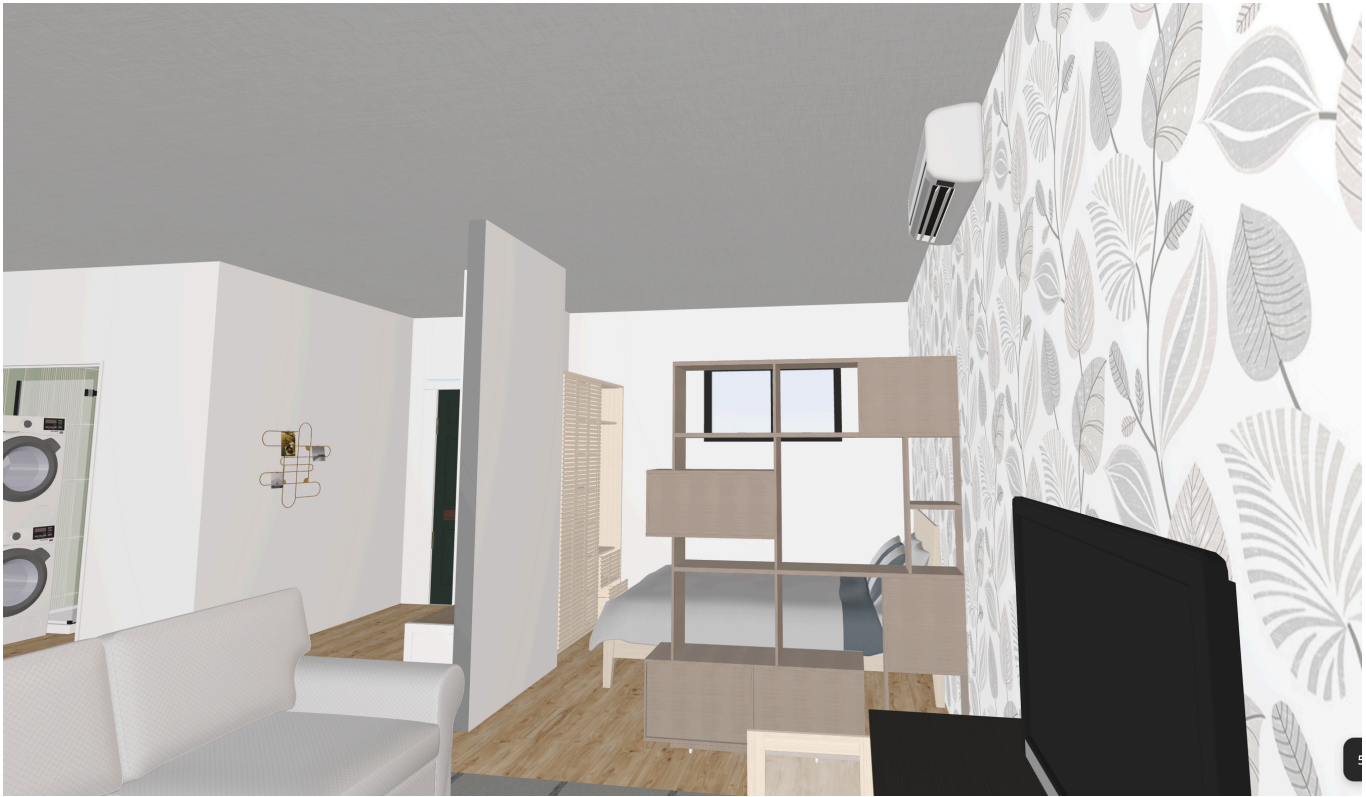
VIEW FROM LIVING AREA TOWARDS BEDROOM AREA WITH BOOKSHELF PARTITION (AND MINI-SPLIT VIEW)