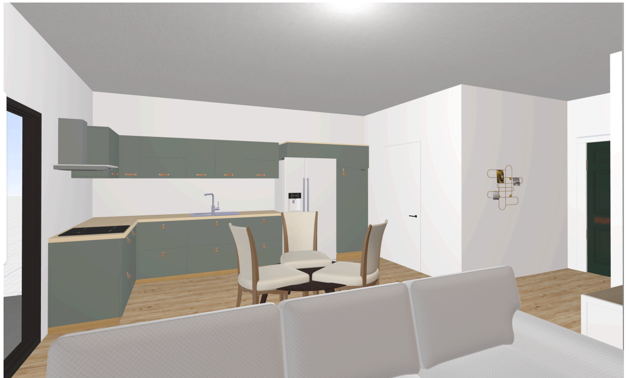
VIEW FROM LIVING AREA TOWARDS KITCHEN AND CLOSED BATHROOM DOOR