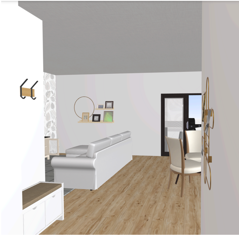
VIEW FROM ENTRY HALLWAY