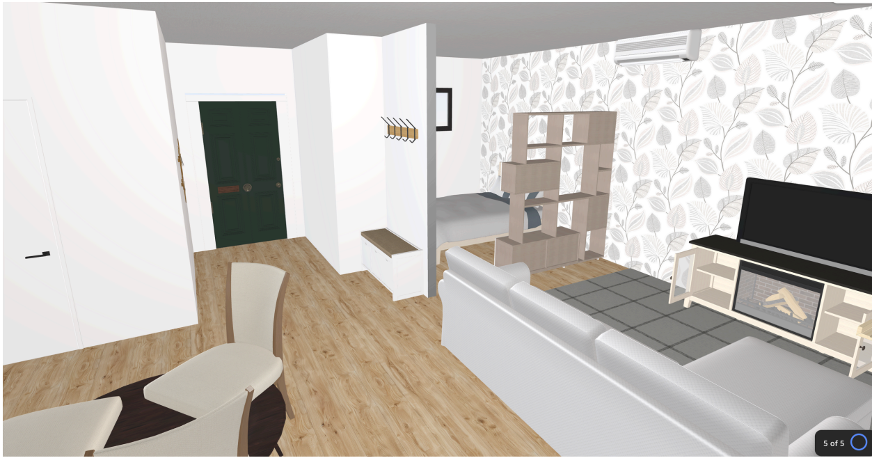
VIEW FROM BACK PATIO DOOR, TOWARDS ENTRY DOOR